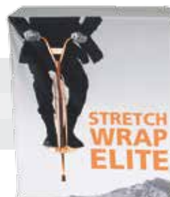
Stretch Wrap: ELITE-SW-G