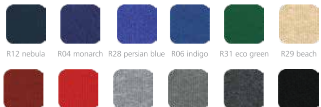
R12 nebula R04 monarch R28 persian blue R06 indigo R31 eco green R29 beach R30 maroon R11 electric red R02 steel R03 charcoal R15 cinder R01 lava

premier - ribbed exhibit & display fabric