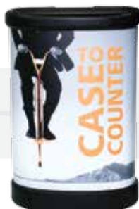
Roll Wrap: OCP-C2C-G