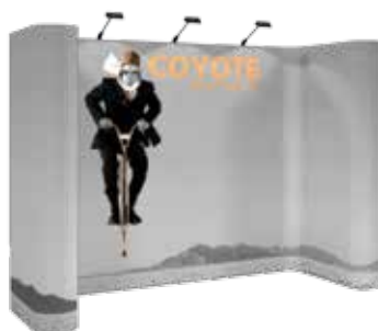
10' standard horseshoe full exhibit system footprint dimensions: 125.2" w x 87.56" h x 54.3" d COY-KKG-HS