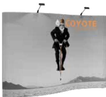
10' serpentine full height display system footprint dimensions: 129.5" w x 87.56" h x 19.5" d COY-KKG-ST-10