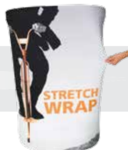
Stretch Wrap: OCP-SW-G