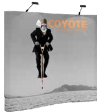
8' serpentine full height display system footprint dimensions: 97.86" w x 87.56" h x 19.5" d COY-KKG-ST-8