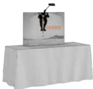
4' tabletop footprint dimensions: 45.5" w x 30.63" h x 12.5" d COY-KKG-1X1-C