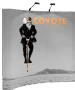
8' full height standard display system footprint dimensions: 97.25" w x 87.56" h x 25" d COY-KKG-3X3-C