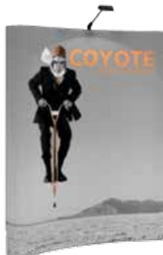
6' full height slim-line display system footprint dimensions: 69.3" w x 87.56" h x 19.25" d COY-KKG-2X3-C