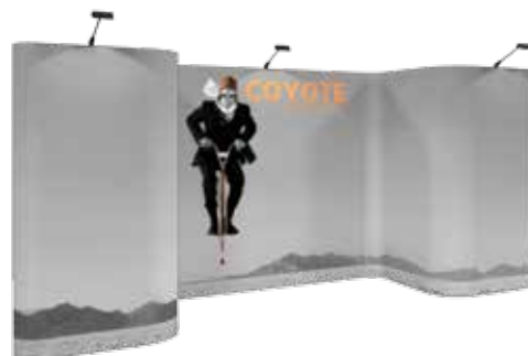
20' deluxe horseshoe full exhibit system footprint dimensions: 193.5" w x 87.56" h x 59.5" d COY-KKG-DHS