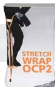
Stretch Wrap: OCP2-SW-G