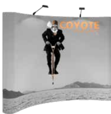
10' full height standard display system footprint dimensions: 118" w x 87.56" h x 36.5" d COY-KKG-4X3-C