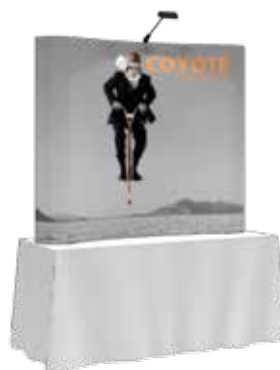
6' tabletop footprint dimensions: 73" w x 59.38" h x 19.25" d COY-KKG-2X2-C