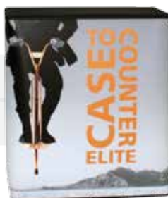
Roll Wrap: ELITE-C2C-G