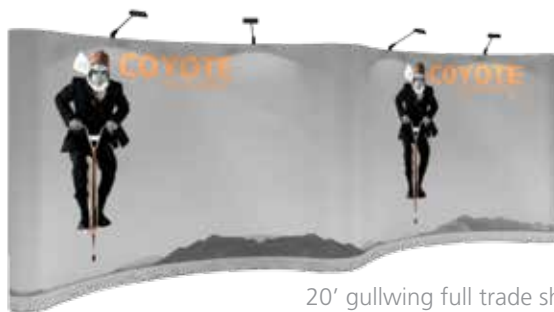
20' gullwing full trade show exhibit system footprint dimensions: 231" w x 87.56" h x 41" d COY-KKG-GW