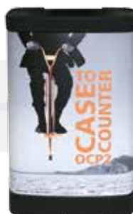
Roll Wrap: OCP2-C2C-G