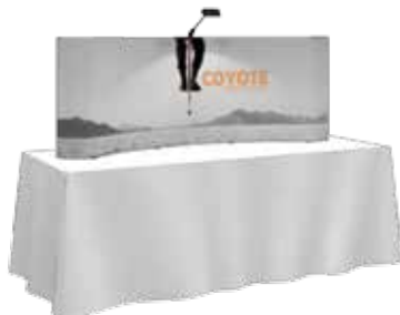
6' tabletop footprint dimensions: 73" w x 30.63" h x 19.25" d COY-KKG-2X1-C