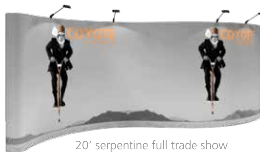
20' serpentine full trade show exhibit system footprint dimensions: 217.75" w x 87.56" h x 60.5" d COY-KKG-20