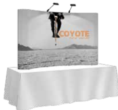
8' tabletop footprint dimensions: 97.25" w x 59.38" h x 25" d COY-KKG-3X2-C